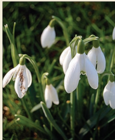
Plúiríní Sneachta Snowdrops

40 achar ar fad, am ar bith ó 9.00 ar maidin go 4.30i.n. ach gearrfar táille €2 chun dul ar an turas faoi threoir agus i gcás grúpaí móra ní foláir clárú roimhtré. Gach eolas ar fáil ach glaoh ar 059 9159444. Bain taitneamh as do chuairt agus fág slán go hoifigiúil le séasúr an Gheimhridh.