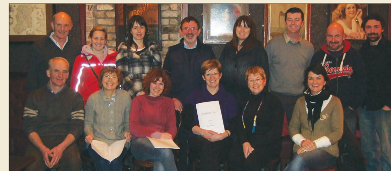
Cuma an-sásta ar Aisteoirí an Lochrainn

shin go dtí le déanaí. Sea, tá an-áthas ar Glór Cheatharlach a fhógairt go bhfuil Aisteoirí an Lochrainn ar ais ar an saol. Tar éis roinnt mhaith cur agus cúiteamh tionóladh cúpla cruinniú thar Mhí Eanáir na bliana seo agus tá an compántas ar ais i mbun gnó. Le meascán d'iar bhail an ghrúpa agus daoine nua táthar ag súil le dráma aonghníomh a léiriú roimh theacht an tsamhraidh. Cuirfead tús leis na seisiúin léitheoireachta agus cleachtas ar Déardaoin na seachtaine seo, 10 Feabhra ag 7.30i.n. i gClub CLG, Cnoc Arda. Beidh céad míle fáilte roimh rannpháirtithe nua agus tá ballraíocht oscailte anois do Chairde Aisteoirí an Lochrainn ar tháille €20 chun tacú leis an gcompántas. Bliain nua agus tús nua. Bí ag faire amach d'Aisteoirí an Lochrainn. Coiméad súil ar an spás seo. Tuilleadh eolais ó Glór Cheatharlach ar 059 9158105, 085 1340047 nó eolas@glorcheatharlach.ie.